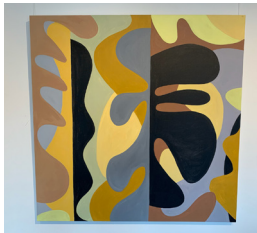
Glory - 2020 48" x 48" Acrylic on canvas