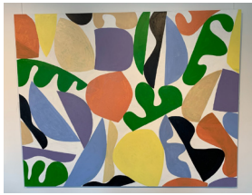
Love Note - 2020 48" x 60" Acrylic on panel