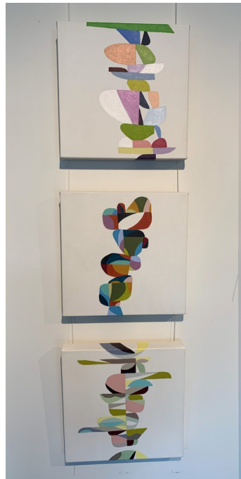
Understanding - 2020 12" x 12" Acrylic on canvas